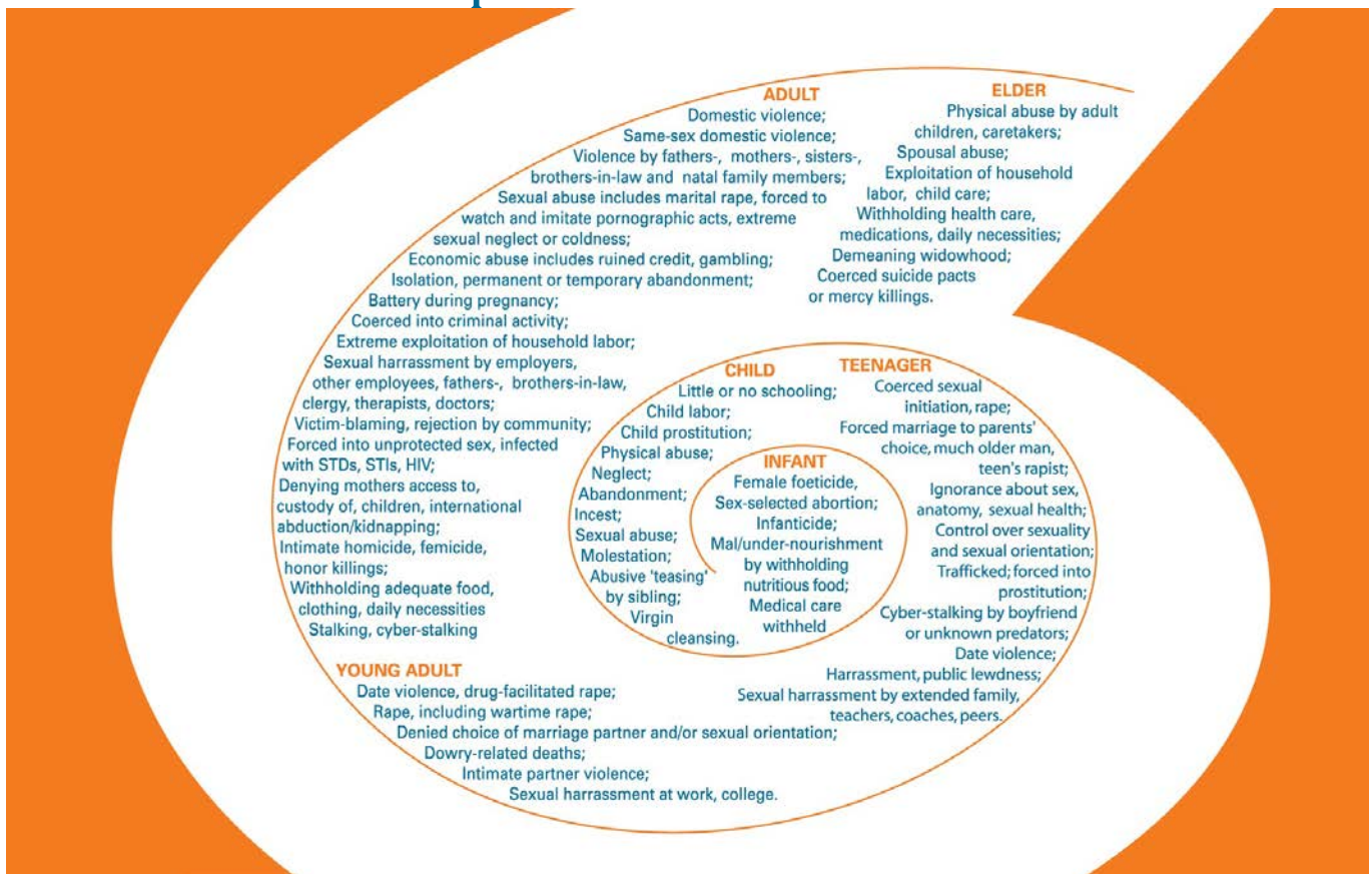
Translated versions of the Lifetime Spiral in Chinese, Farsi, Korean, Punjabi, Tagalog and Vietnamese available at api-gbv.org . January 2002. Revised 2010.

From the aborting of female fetuses to intimate homicide, girls and women may encounter numerous oppressions during infancy, childhood, adolescence, adulthood, and as elders. Some of these are confined to one stage in the lifecycle, some continue into subsequent stages.