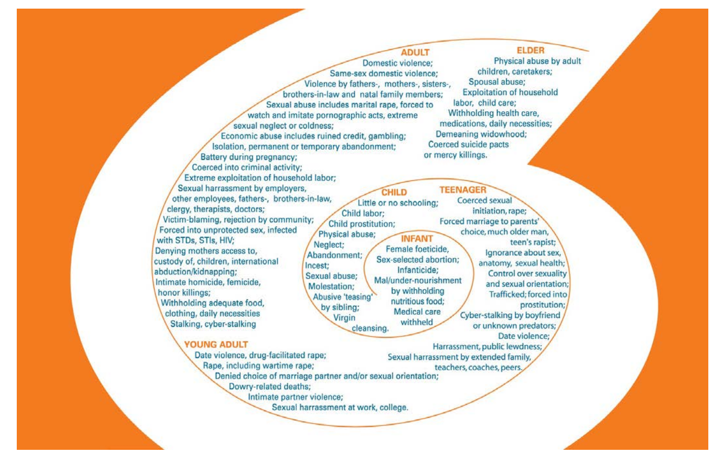
Translated versions of the Lifetime Spiral in Chinese, Farsi, Korean, Punjabi, and Tagalog available at api-gbv.org. January 2002. Revised 2010.

From the aborting of female fetuses to intimate homicide, girls and women may encounter numerous oppressions during infancy, childhood, adolescence, adulthood, and as elders. Some of these are confined to one stage in the lifecycle, some continue into subsequent stages. Domestic violence is just one amongst many forms of violence against women. It is about more than physical, sexual, economic and emotional battering; it is also about living in a climate of fear. The lives of abused Asian and Pacific Islander women are shadowed by the cultural burdens of shame and devaluation.