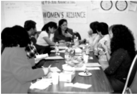
Although domestic violence is the main topic of discussion, other topics include dilemmas of newly arrived immigrants.