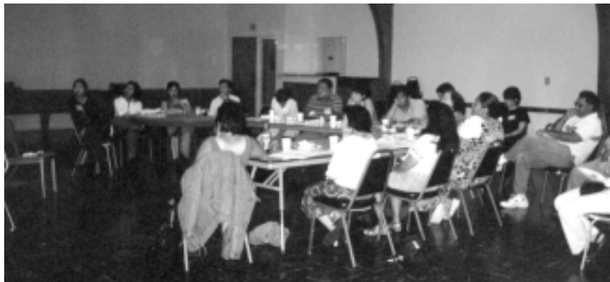
Trained Bilingual and Bicultural Outreach Volunteers

The volunteers are people who are "natural helpers" in the community. They may be hair stylists, café owners, day care providers, bartenders, teachers—they are the ones other people talk